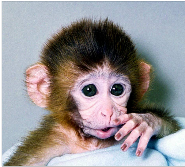
News-makers/Oregon Regional Primate Research Center